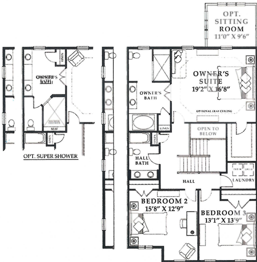
Second Floor Plan Interior Unit Standard